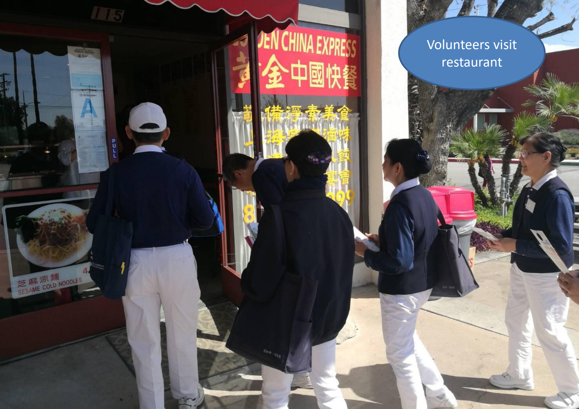
Volunteers visit restaurant